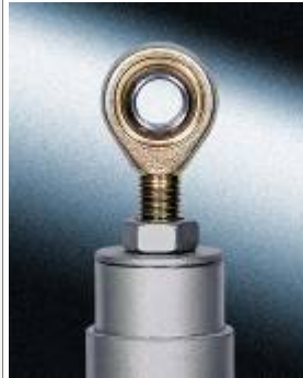
Industrial grade rod end