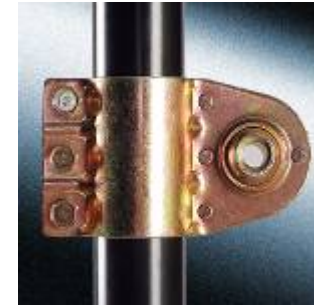
super-grip heavy duty Bracket