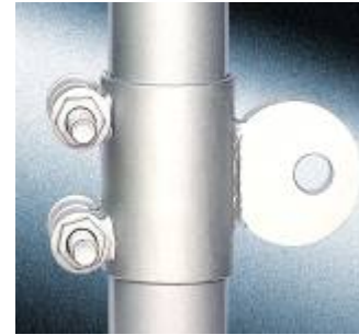
super-grip heavy duty bracket