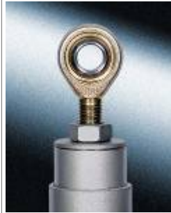
Industrial grade rod end